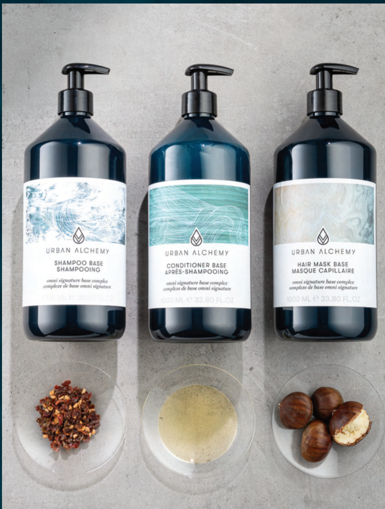
Back Bar Bases