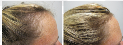
DAY 0 DAY 90

Viviscal was originally developed in the late 1980s in Scandinavia, and the first clinical trial proving its efficacy was published in 1992 in The Journal of International Medical Research . Since then, we have conducted numerous trials internationally to prove the efficacy of Viviscal supplements.