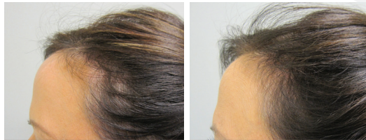
DAY 0 DAY 90