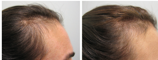
DAY 0 DAY 90