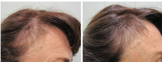
DAY 0 DAY 90